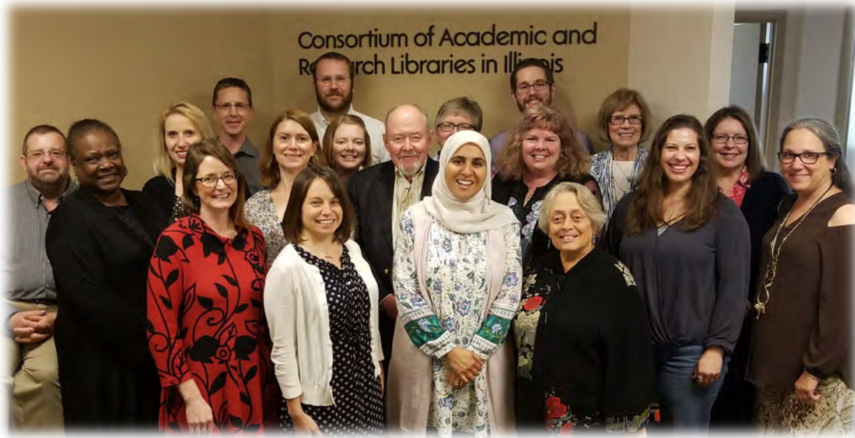
2018 New Directors' Institute Attendees and Speakers

Save the date! New Directors' Institute May 15 & 16, 2019 Champaign