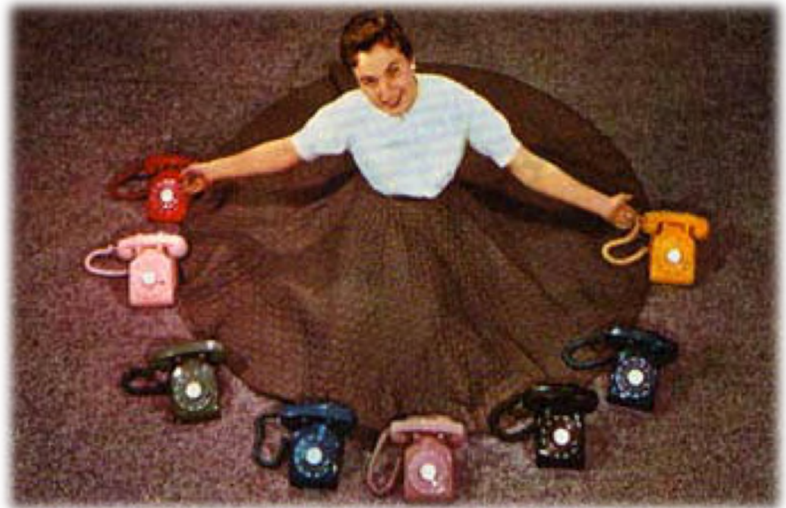
Original Curt Teich Postcard Donation Newberry Library