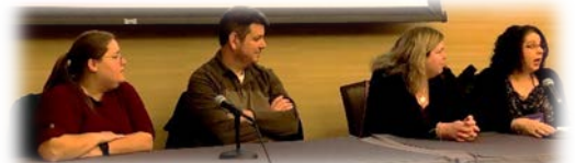
Cohort One Alumni Panel