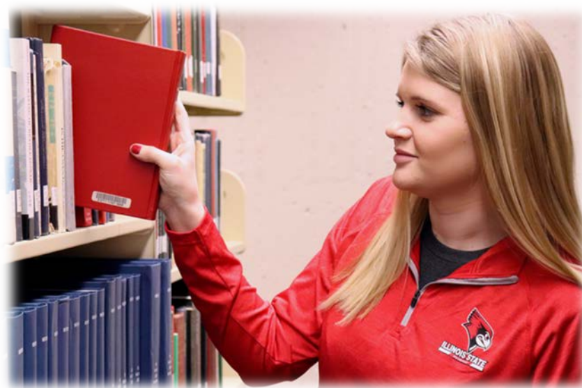
Illinois State University