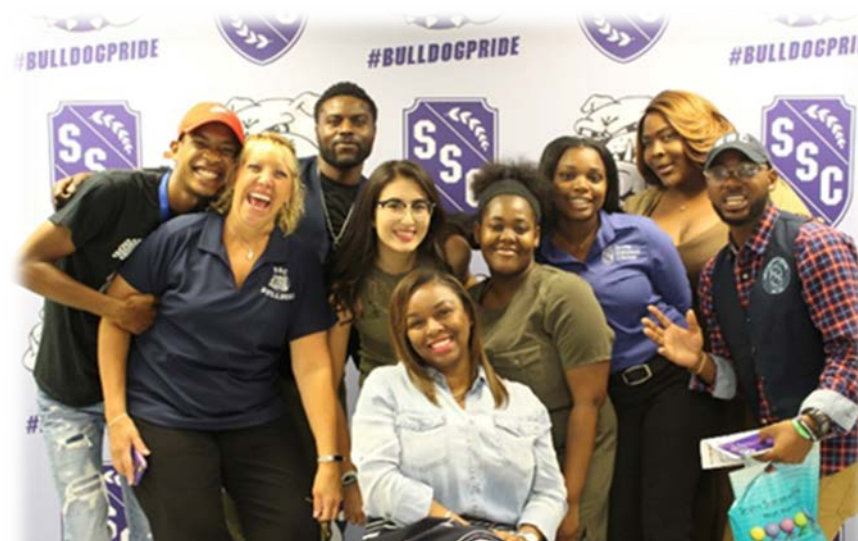
South Suburban College