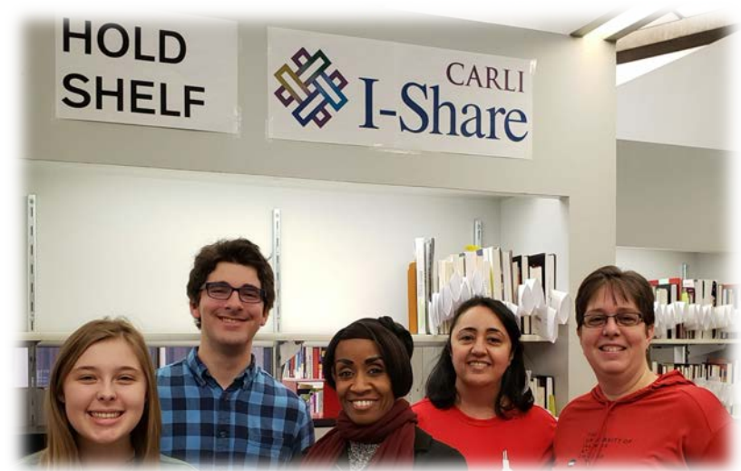
University of Illinois at Chicago