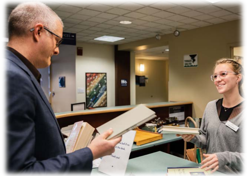
Trinity International University