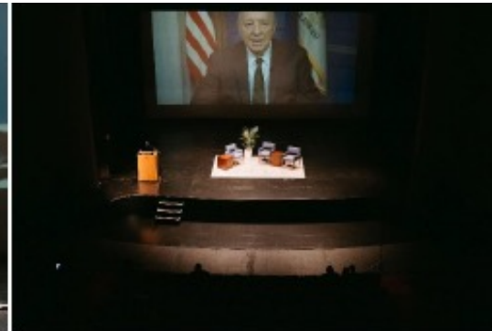
US Senator Dick Durbin's recorded message plays