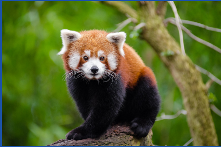
Red Panda