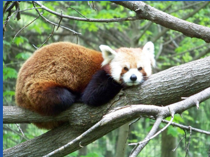
Red Panda