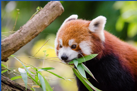
Red Panda