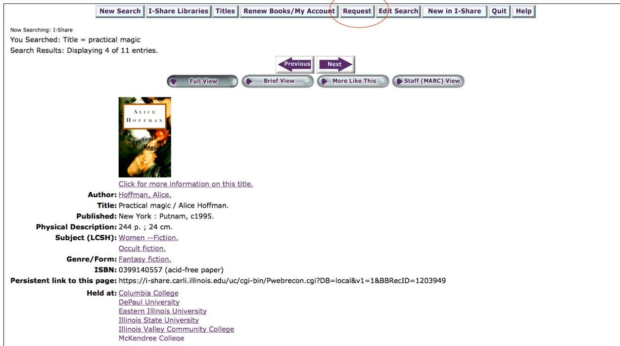
Figure 5: Full view of record #4. (this screen shot is only a partial view of the record). Note the Request button [circled] on the top menu.

This page shows the “Full View” of the selected record. On this page the user can view detailed bibliographic information and the list of I-Share libraries that own the item. Either scroll the page or click a library in the list to view details about the location and status of the item in that library. “Staff (MARC)” view is also available.